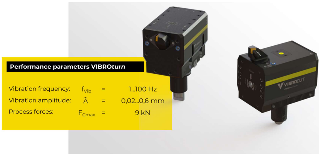
Figure 4: Tool holders L-Line and T-Line

VIBROturn is a patented system developed by VibroCut GmbH. We act as a product and technology provider as well as an integration partner for the use of vibration-assisted machining in your production. We sell our vibration systems as tool holders for equipping new and existing machines and offer related services.