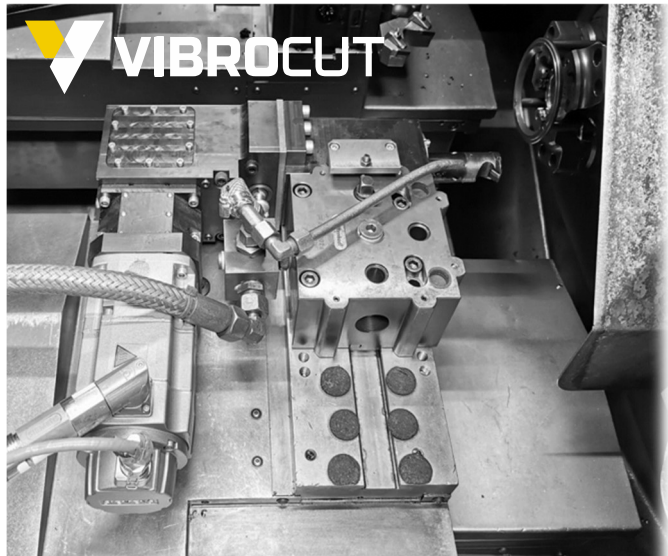
Figure 2: VIBROturn with its own drive [1]

introduced into the chip as it runs off, causing the chip to break. The retrofittable unit achieves vibration amplitudes of up to 0.4 mm at a maximum frequency of up to 100 Hz. The integration into the machine control not only enables the vibration to be switched on and off via the NC program, but also allows the vibration characteristics to be changed for different cutting operations. In the application, the internal machining of a wheel bearing ring was superimposed with a vibration in the frequency range 81 Hz to 88 Hz with a vibration amplitude of 0.19 mm in order to achieve robust chip breaking. The internal turning process was carried out with a standard cutting insert on a boring bar (Ø32 mm) with feed rates of 0.4 to 0.5 mm and cutting depths of up to 3 mm.